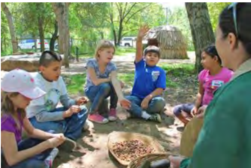
Children gain an understanding and respect for the Maidu culture