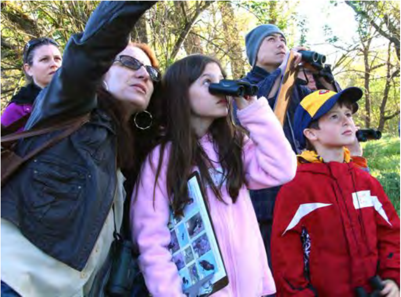
Families scanning the trees at the Bird and Breakfast event

“We are so impressed with the organization of the camp and its leaders. My son comes home every day with so much information and stories to share!”