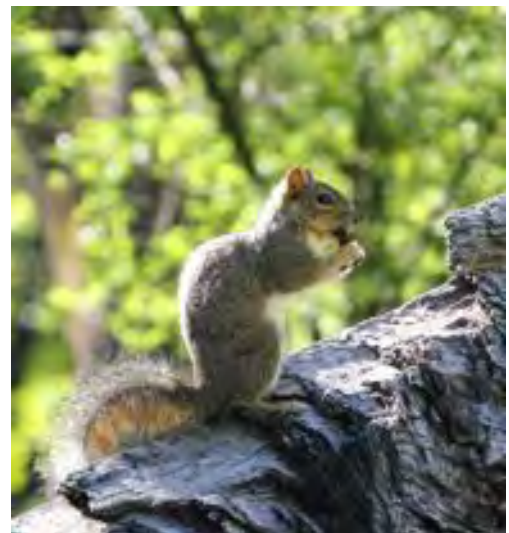
One of the many reasons our youngest visitors love the Nature Preserve