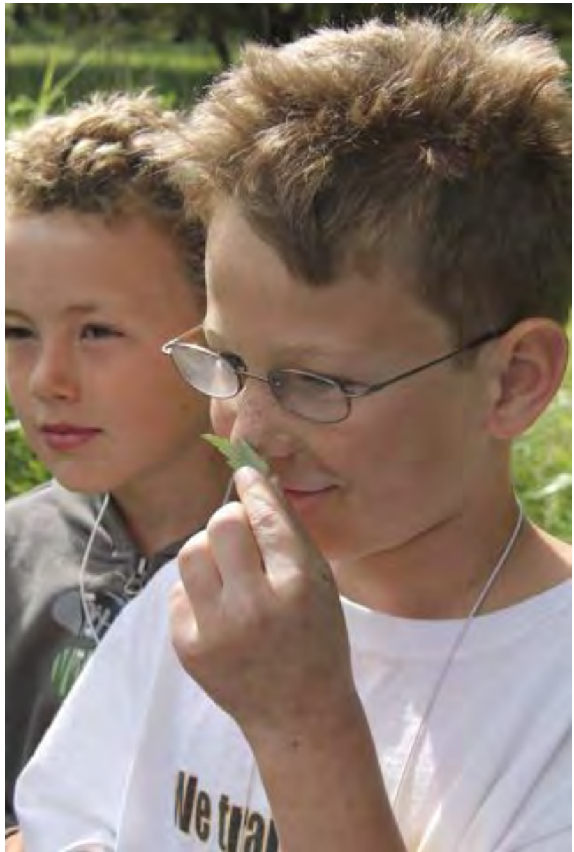
Students learning about local native plants

~ 1 st grade teacher on a classroom Outreach Presentation