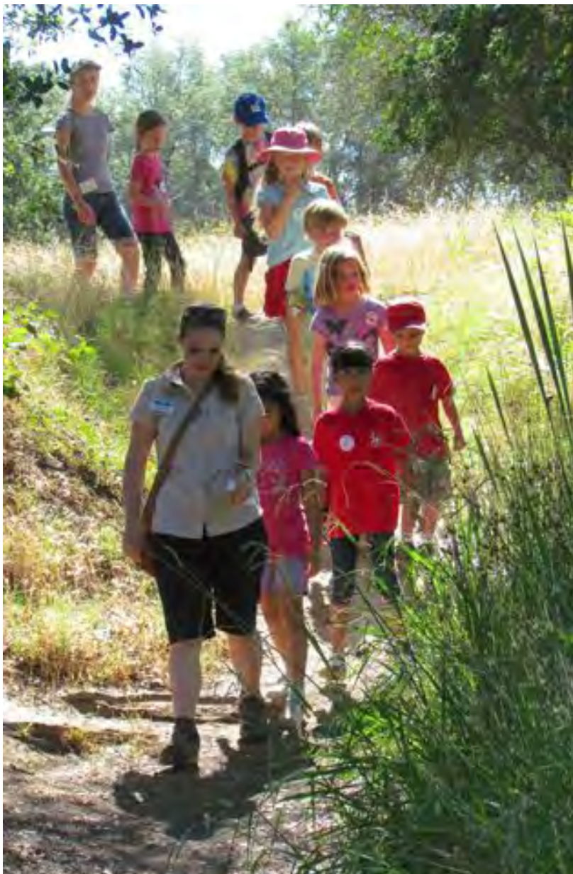
The Naturalists create, plan, and execute all of our educational programs