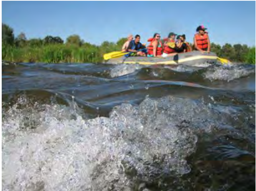
Board members, staff and volunteers get a chance to enjoy the Lower American River