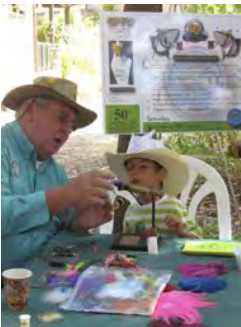
Exhibitors, such as Trout Unlimited and California Fly Fishers Unlimited, help make Nature Fest a successful annual event