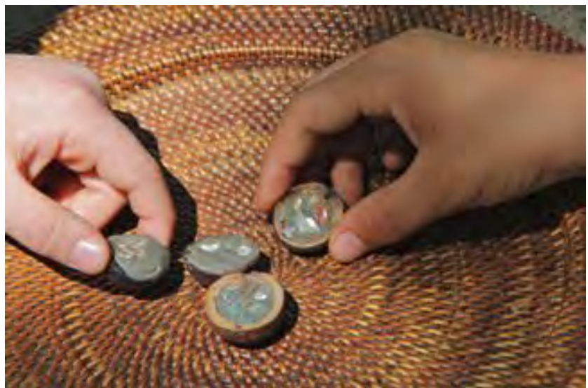
Students enjoy hands-on learning during camps and educational programs