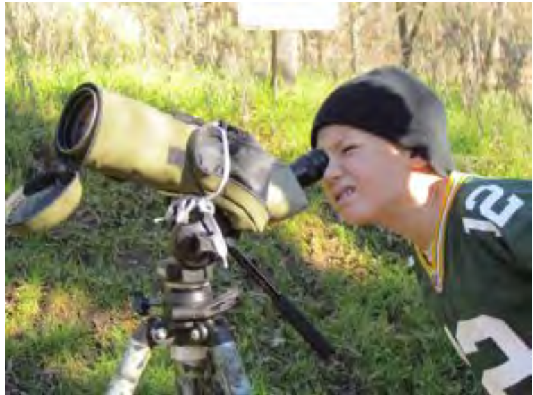
Part of the Nature Center experience is seeing one's environment in a new way

~ Kindergarten teacher on the Nature Area Tour