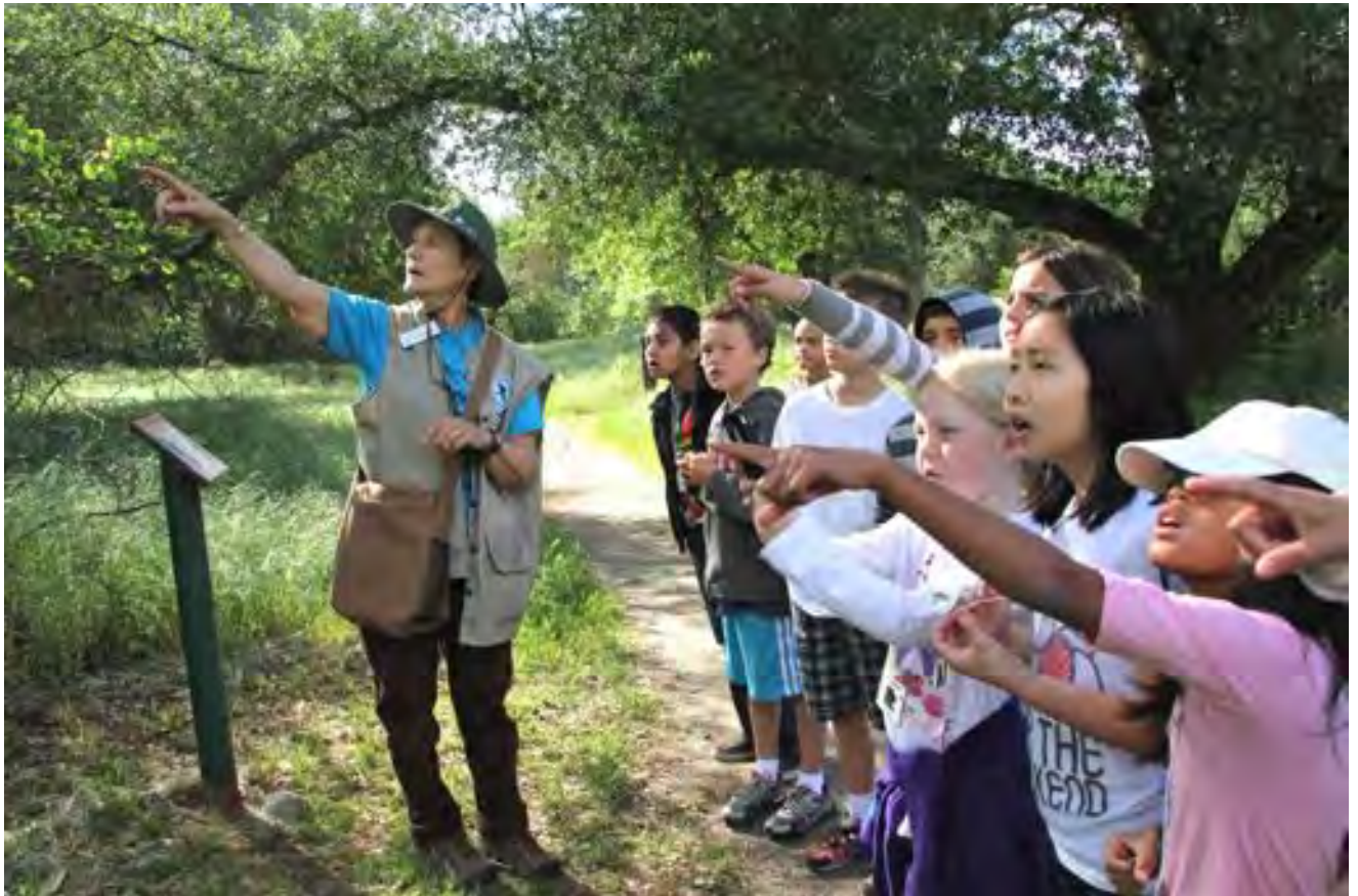
Students making discoveries during a nature hike at Effie Yeaw Nature Center