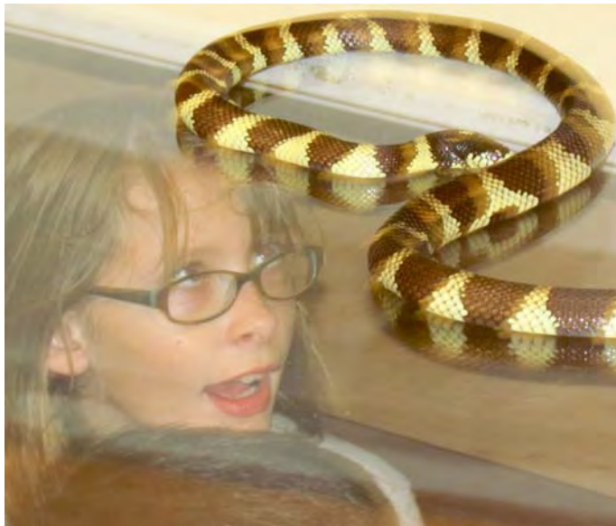
Understanding a snake from beneath clear acrylic sheet